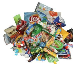
CHIP BAGS, FOOD WRAPPERS