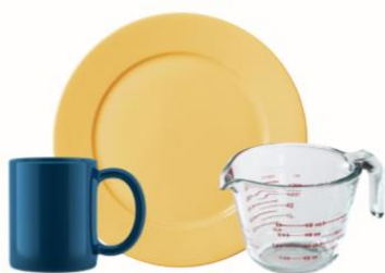
DISHES OR BAKING GLASS