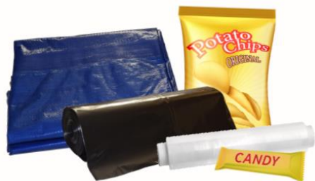
PLASTIC WRAP, FILMS OR TARPS