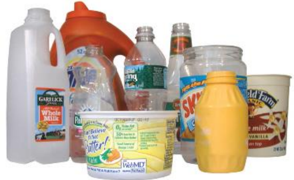
PLASTICS (#1, #2, #5 & #7)