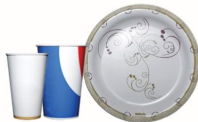
COATED PAPER ITEMS