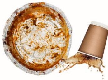
DIRTY RECYCLING OR LIQUIDS