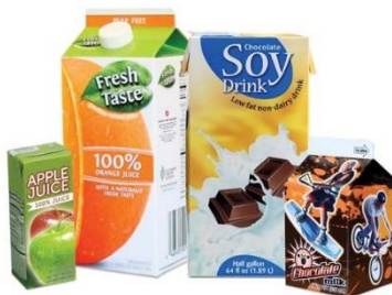
ASEPTIC/WAX COATED CONTAINERS